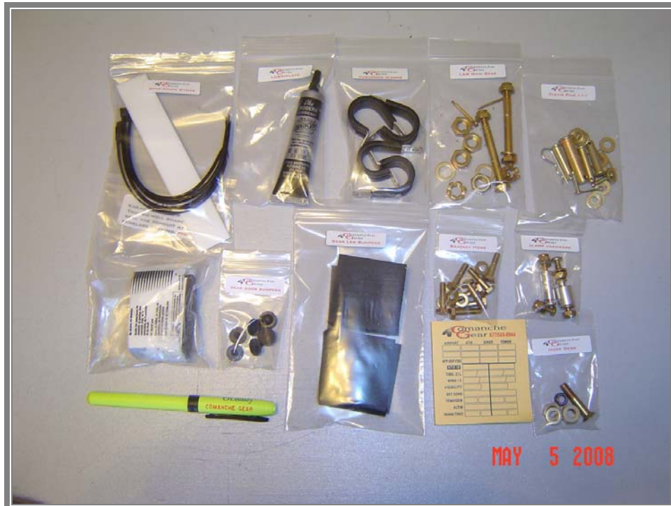
BAGGED HARDWARE PLUS OTHER COMPONENTS