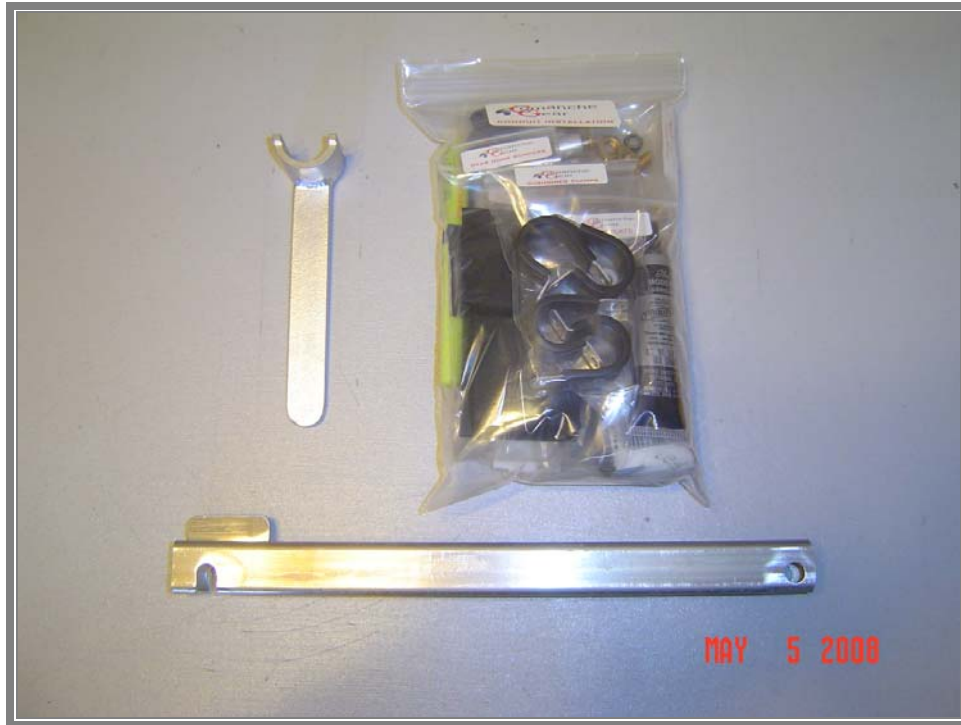
TOOLING AND BAGGIE CONTENTS

10340 REGENT CIRCLE ∞ NAPLES, FL 34109 PHONE & FAX 239/593-6944 ∞ CELL 239/404-7524